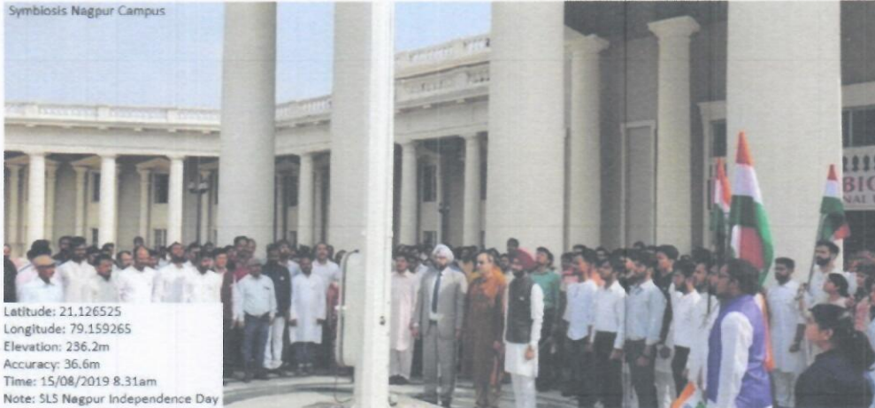
Symbiosis Nagpur Campus

Latitude: 21.126525 Longitude: 79.159265 Elevation: 236.2m Accuracy: 36.6m Time: 15/08/2019 8.31am Note: SLS Nagpur Independence Day