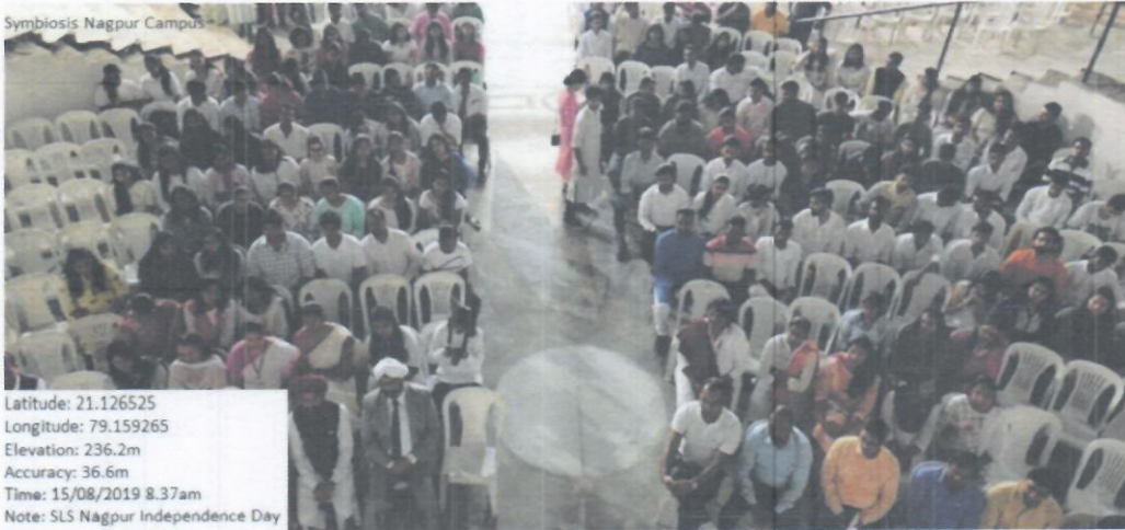
Symbiosis Nagpur Campus

Latitude: 21.126525 Longitude: 79.159265 Elevation: 236.2m Accuracy: 36.6m Time: 15/08/2019 8.37am Note: SLS Nagpur Independence Day